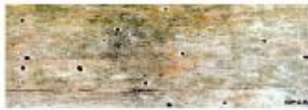
bamboo infected by borers