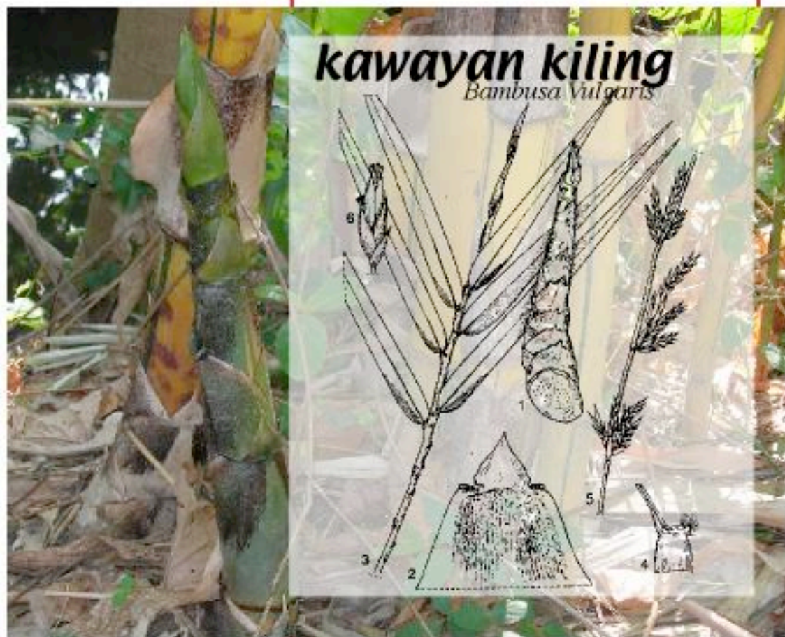
kawayan kiling Bambusa Vulgaris

Medium strength bamboo, good for boat construction, furniture, handicrafts and paper. Very susceptible to powder post beetle infection.